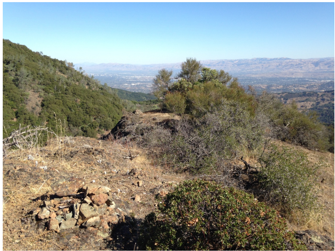
Figure 1. Southwesterly view of the overlook