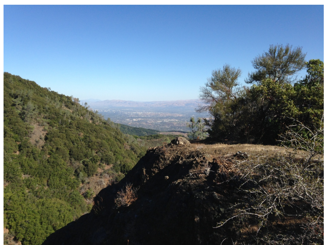
Figure 2. View of the steep drop-off on the northern side of the overlook.