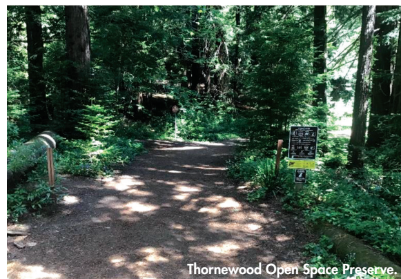
Thornewood Open Space Preserve.