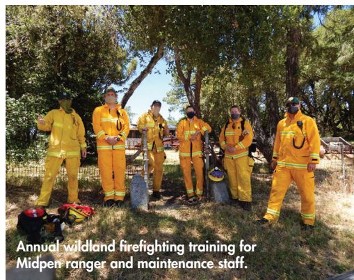
Annual wildland firefighting training for Midpen ranger and maintenance staff.