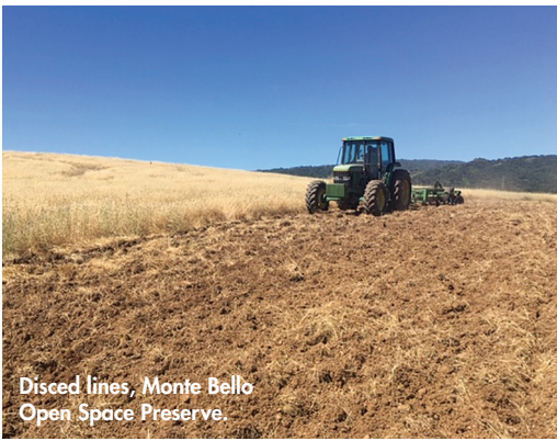
Disced lines, Monte Bello Open Space Preserve.