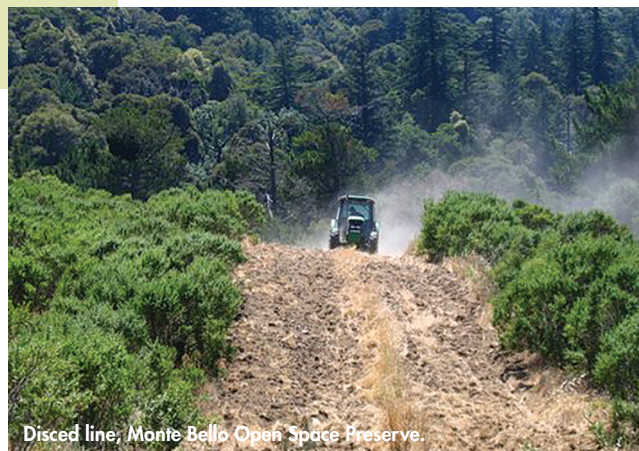
Disced line, Monte Bello Open Space Preserve.

For a full list of Midpen's vegetation management projects, visit openspace.org/fire .