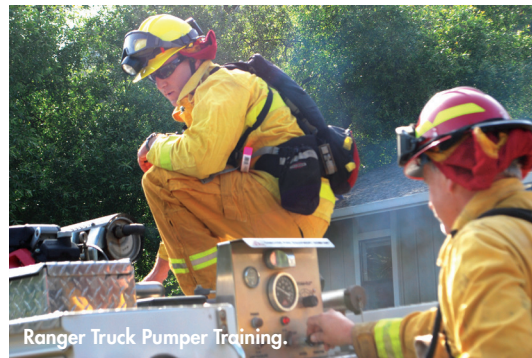
Ranger Truck Pumper Training.