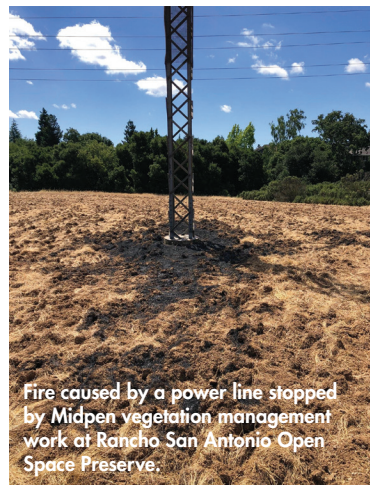
Fire caused by a power line stopped by Midpen vegetation management work at Rancho San Antonio Open Space Preserve.