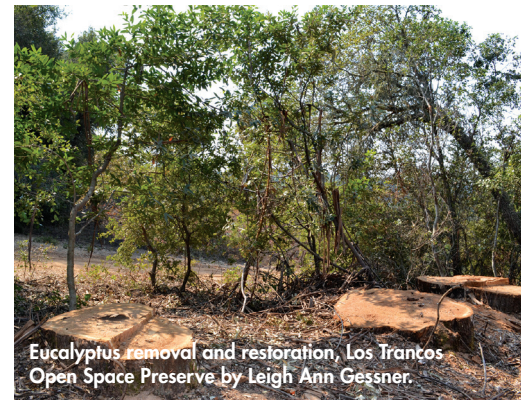
Eucalyptus removal and restoration, Los Trancos Open Space Preserve by Leigh Ann Gessner.