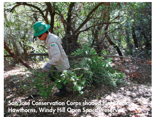
San Jose Conservation Corps shaded fuel break Hawthorns, Windy Hill Open Space Preserve