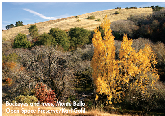
Buckeyes and trees, Monte Bello Open Space Preserve