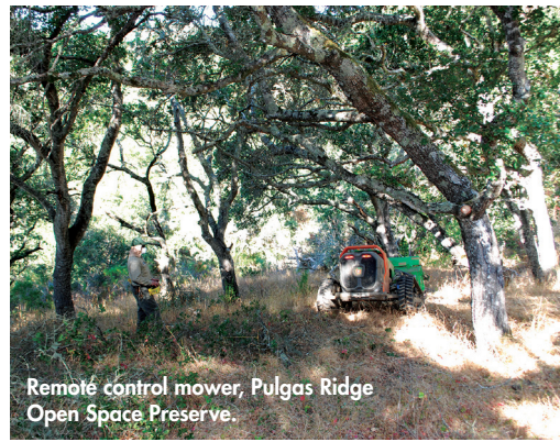
Remote control mower, Pulgas Ridge Open Space Preserve.