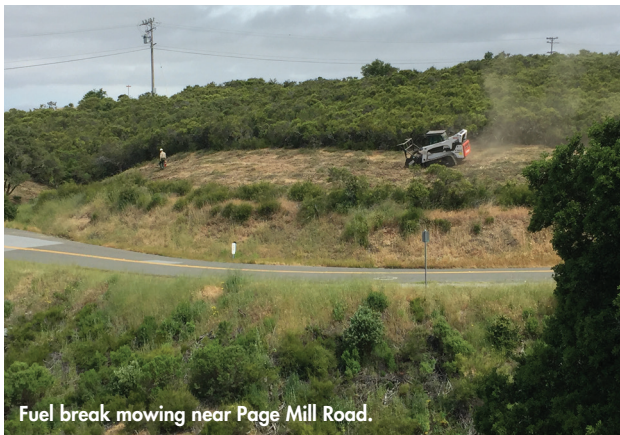
Fuel break mowing near Page Mill Road.