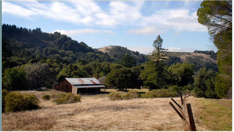
Coal Creek Open Space Preserve (Erica Freeman)