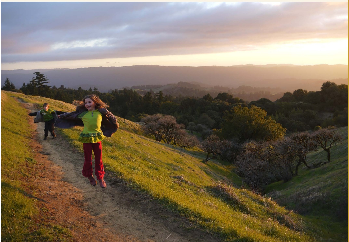
Russian Ridge Open Space Preserve (Anne-Sophie Gaudet)