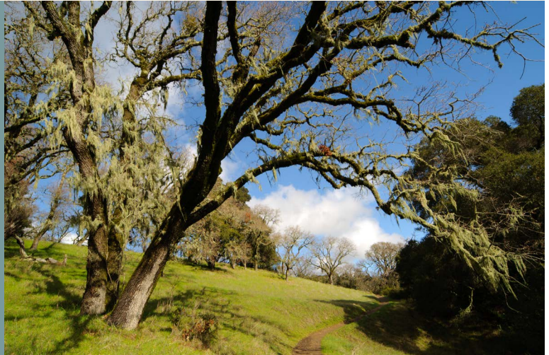
Windy Hill Open Space Preserve