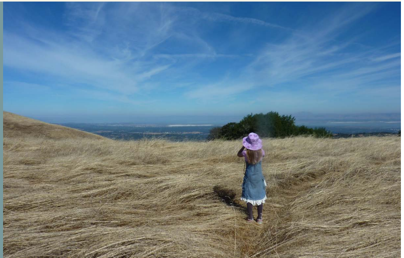
Russian Ridge Open Space Preserve (Romain Laboisie)