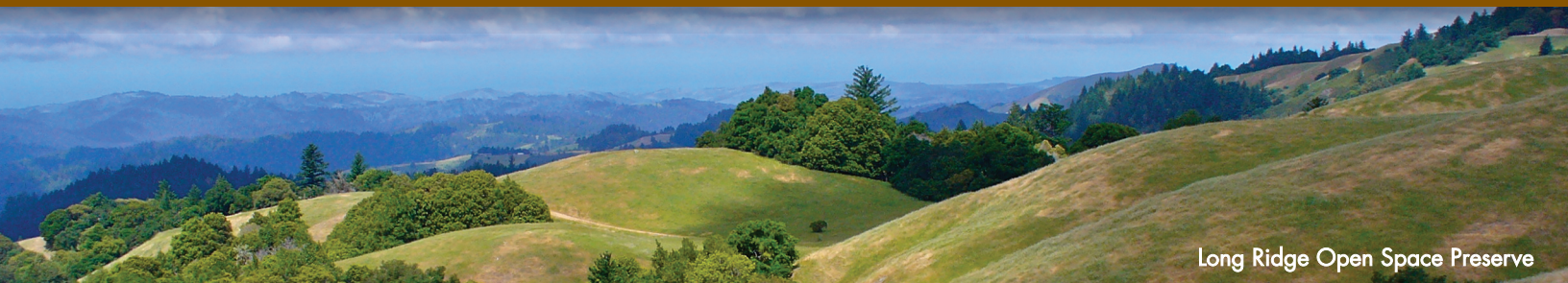
Long Ridge Open Space Preserve