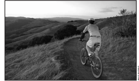
Monte Bello Open Space Preserve

There are many exciting and adventurous trails for you to enjoy on your mountain bike on Midpeninsula Regional Open Space District preserves. Sixteen open space preserves are open to mountain biking, and include designated trails at: