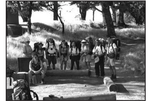
Monte Bello Open Space Preserve