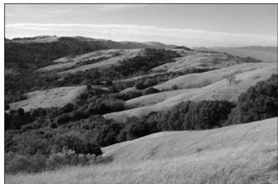
Monte Bello Open Space Preserve

Created in 1972, the District is an independent special district that has preserved over 57,000 acres of public land and manages 26 open space preserves. The District's boundary extends from San Carlos to Los Gatos and to the Pacific Ocean from south of Pacifica to the Santa Cruz County line. The District's purpose is to create a regional greenbelt of unspoiled public open space lands in order to permanently protect the area's natural resources and to provide for public use and enjoyment.