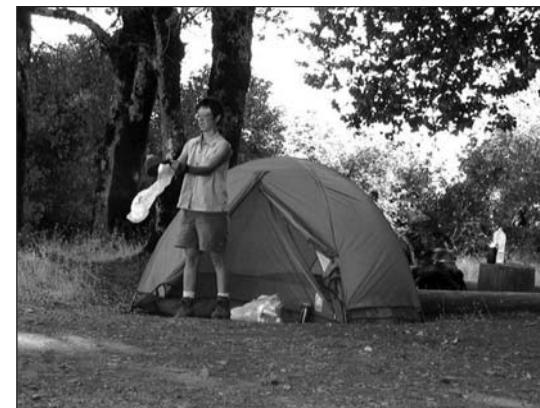
Monte Bello Open Space Preserve

This is a very primitive area, kept so because of its inaccessibility either by road or trail. On the Morell, Winship, Johnson properties no destructive mark of fire or axe can be found. The land remains much as it was a century ago. Wildlife abounds. A magnificent coyote chorus greets the rising moon from a bald promontory. Coons, wild cats and foxes seem to be everywhere. Mountain lions have been