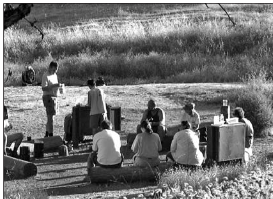
Monte Bello Open Space Preserve

Pack it in. Pack it out. Trash cans are not available. Please plan to carry out everything you bring in, including refuse. Help care for the site; if you find trash left behind, please carry it out with you.