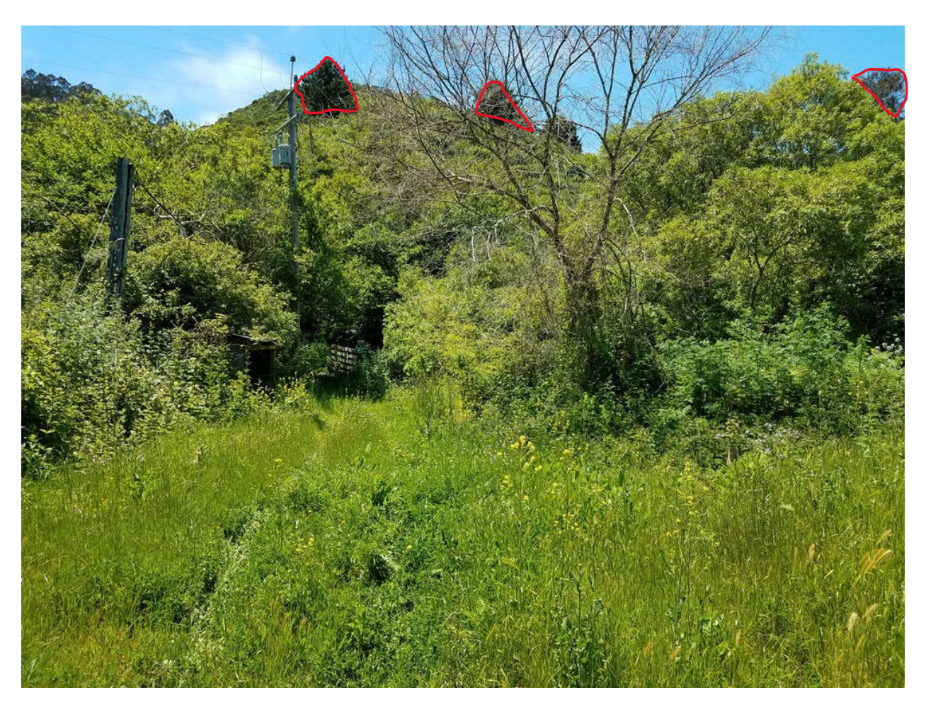
Representative photo from the general project area. Red indicates tree species of concern and slated for removal (Eucalyptus, cypress).