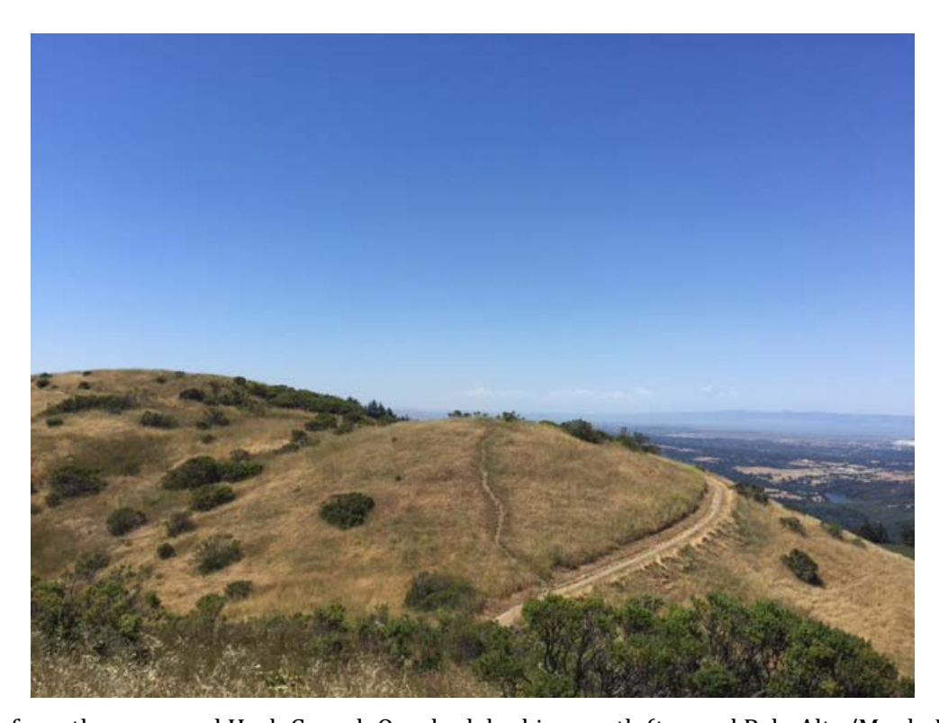
View from the proposed Herb Grench Overlook looking north (toward Palo Alto/Menlo Park)