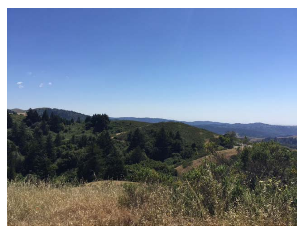
View from the proposed Herb Grench Overlook looking east