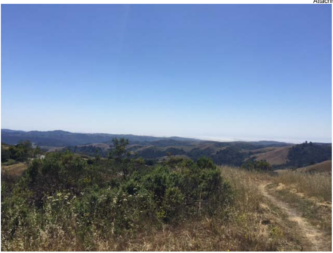
View from the proposed Herb Grench Overlook looking south