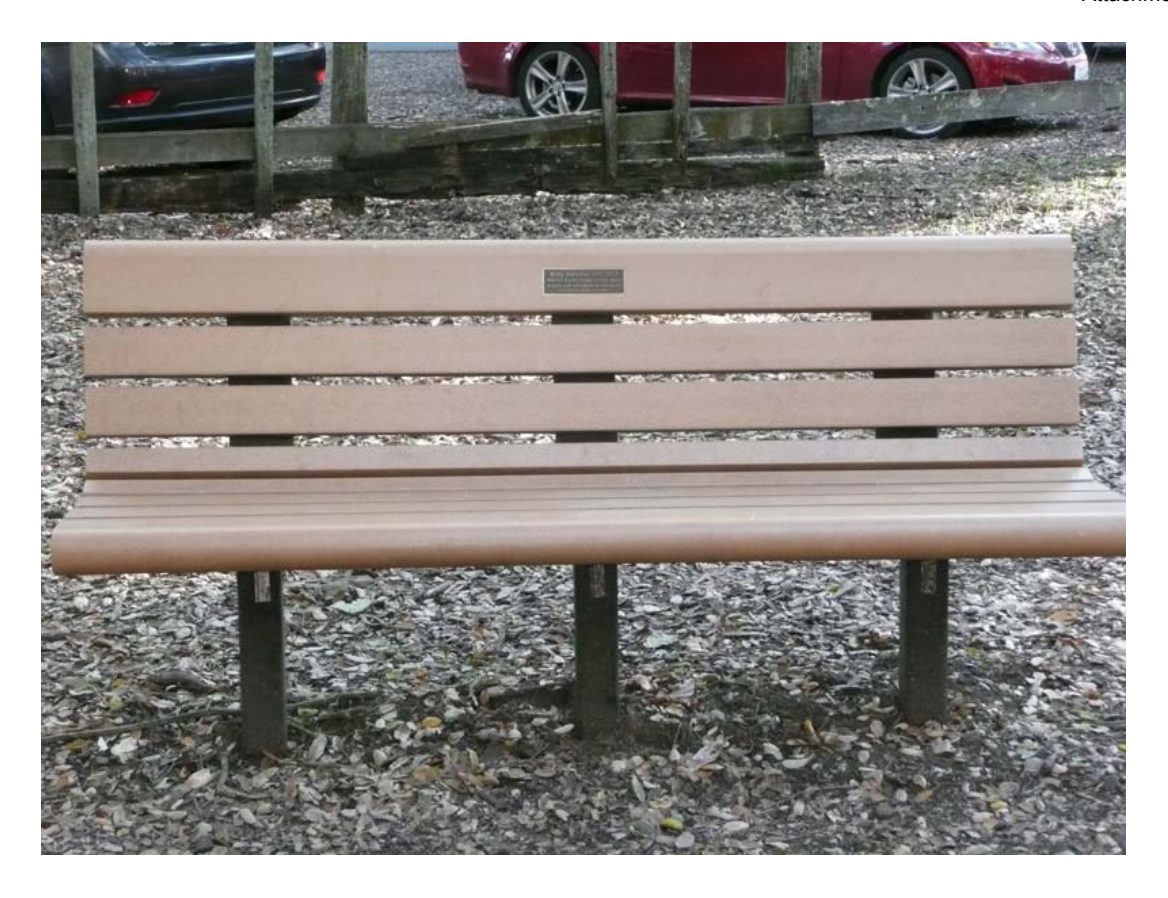
Standard District Bench – bench type for the proposed Herb Grench bench