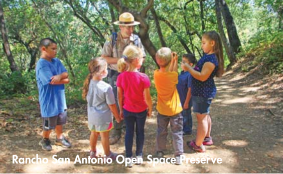
Rancho San Antonio Open Space Preserve