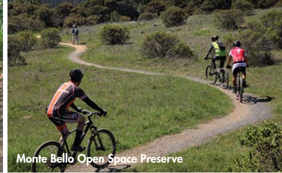
Monte Bello Open Space Preserve