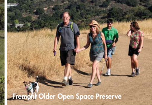
Fremont Older Open Space Preserve