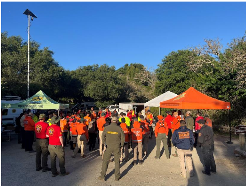
Search and rescue personnel meet for morning briefing on Tuesday, May 6, 2025