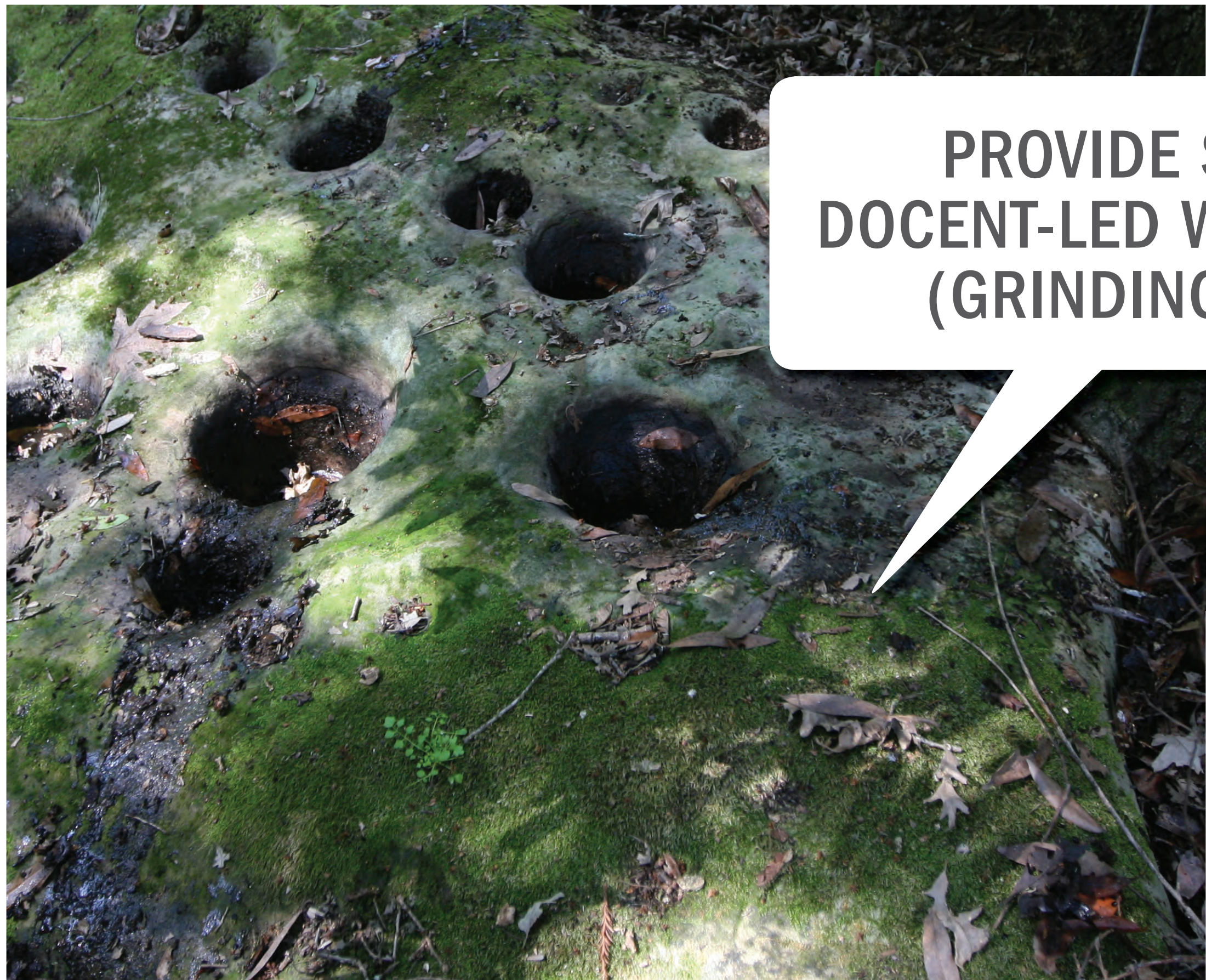
PROVIDE SIGNAGE AND DOCENT-LED WALKS TO MORTAR (GRINDING ROCK) SITES

A Protect and interpret significant historical and cultural resources