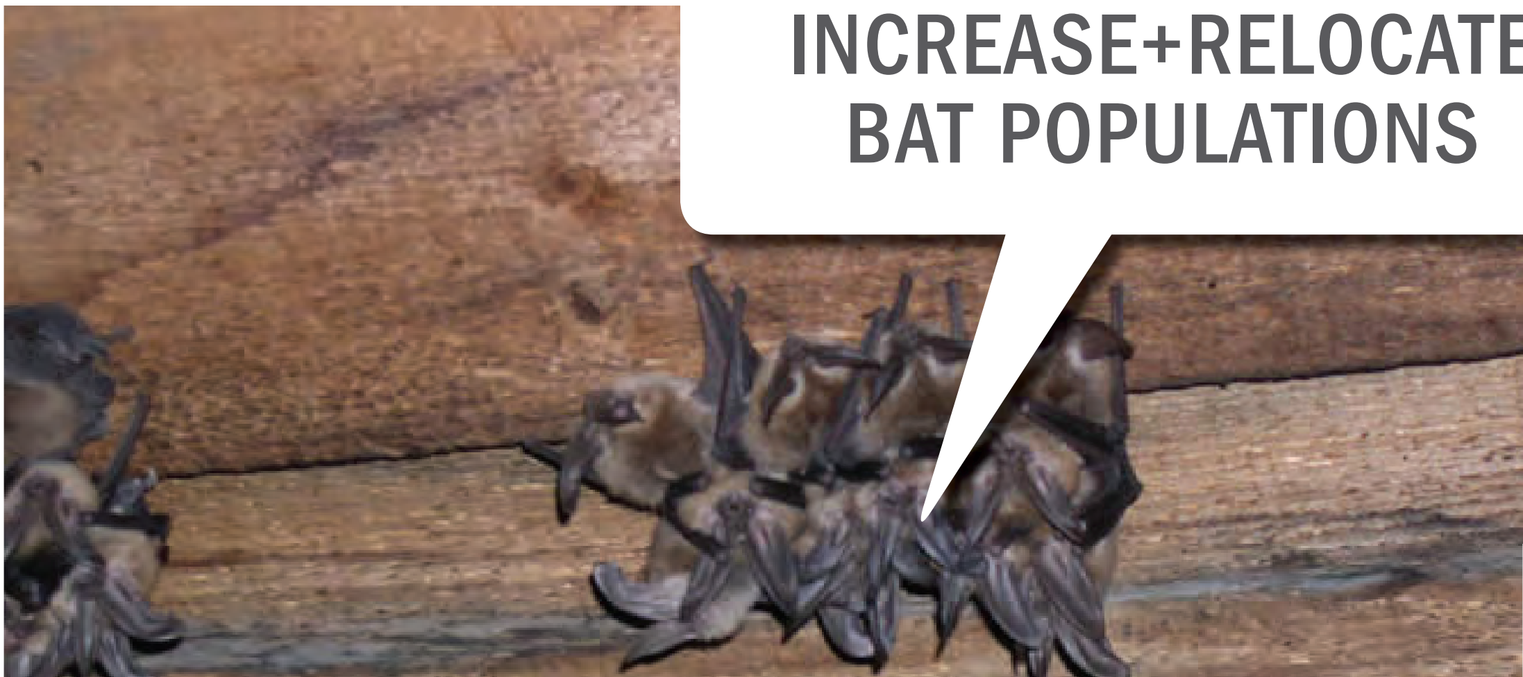
INCREASE+RELOCATE BAT POPULATIONS