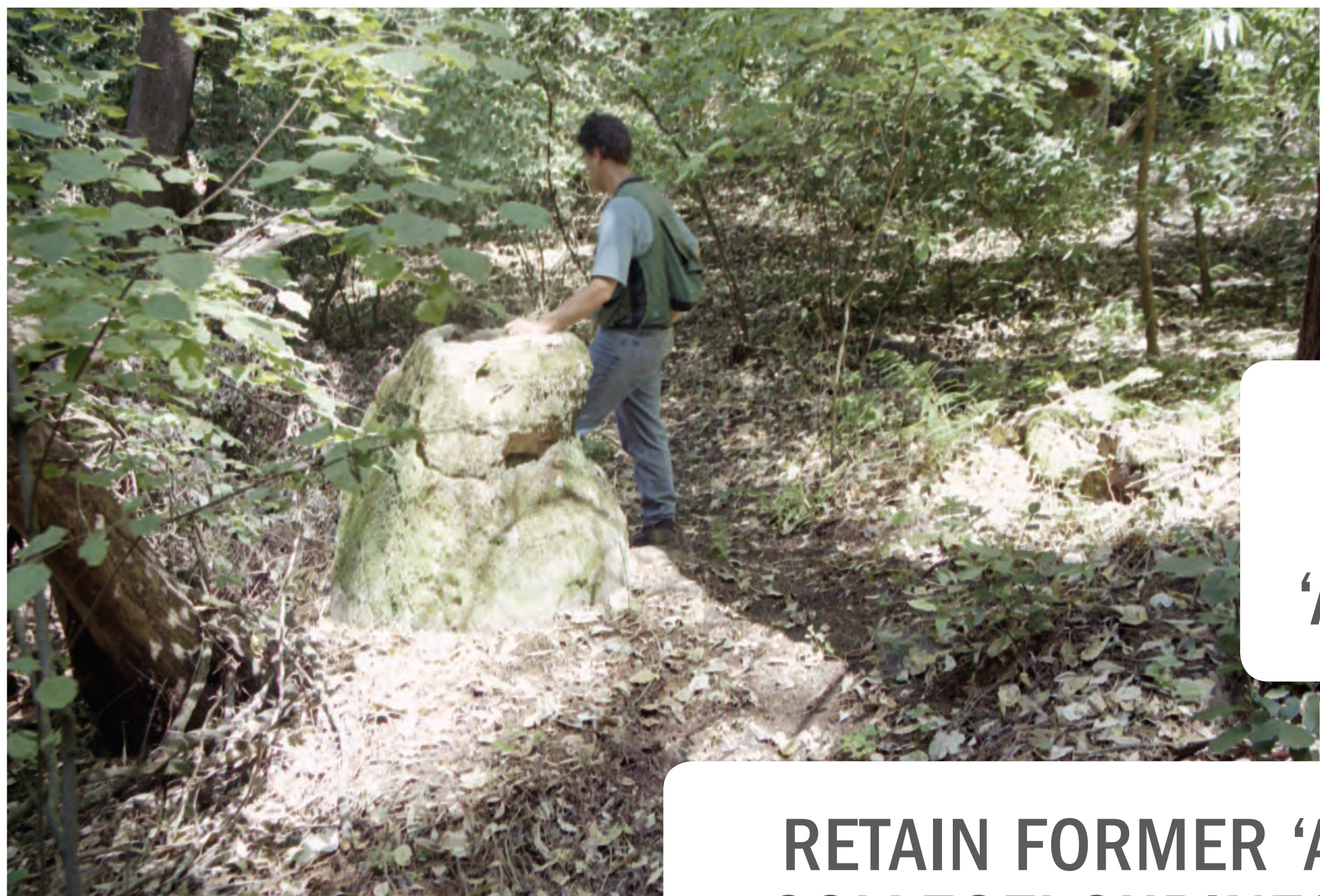
RETAIN FORMER 'ALMA COLLEGE' SHRINES FOR ON-SITE INTERPRETATION