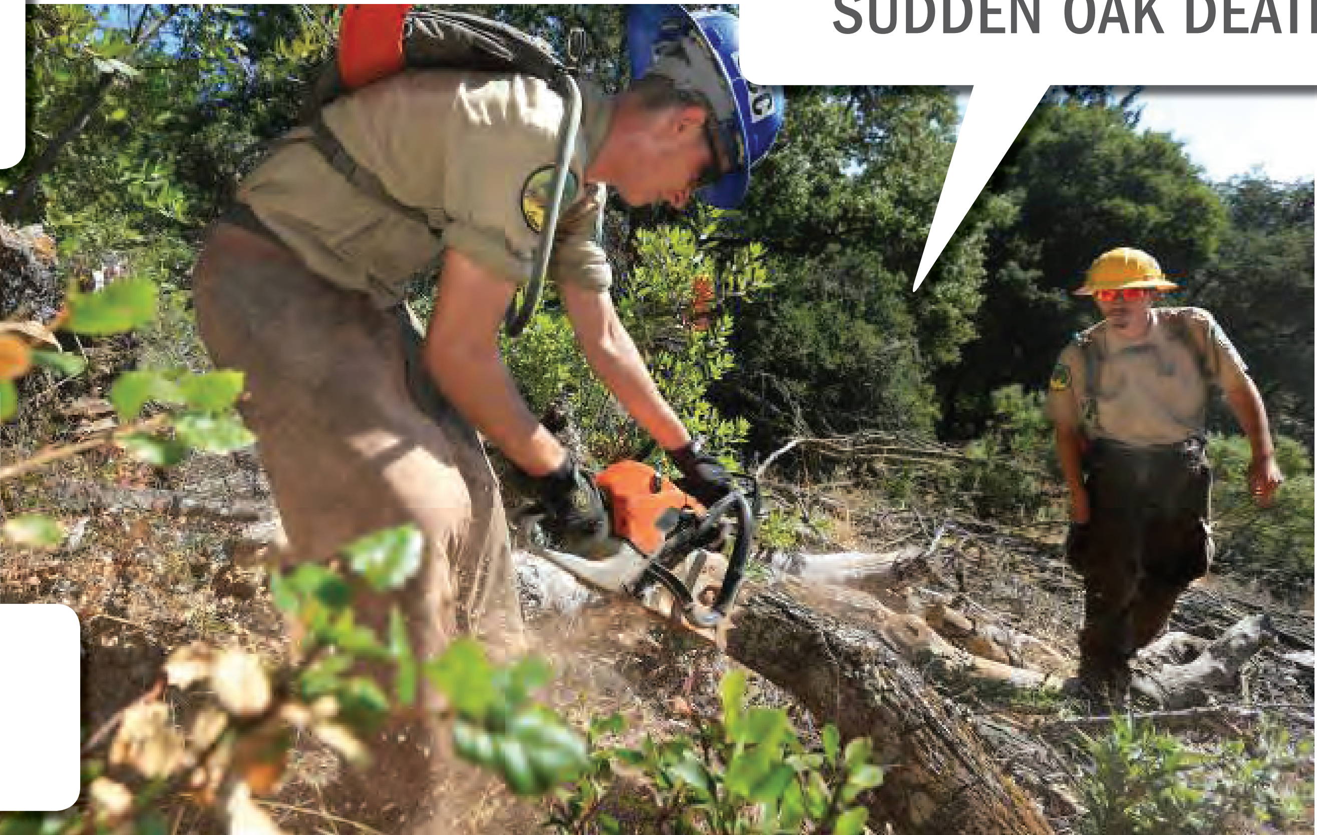
REDUCE SPREAD OF SUDDEN OAK DEATH