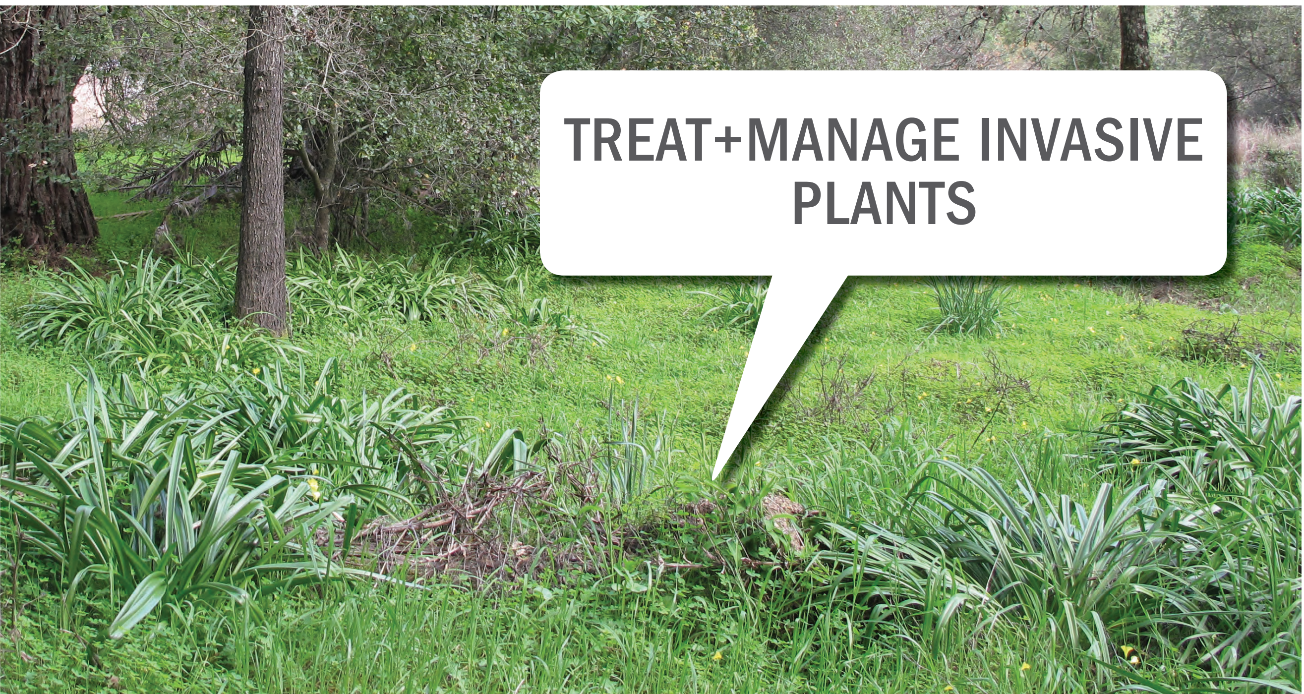
TREAT+MANAGE INVASIVE PLANTS