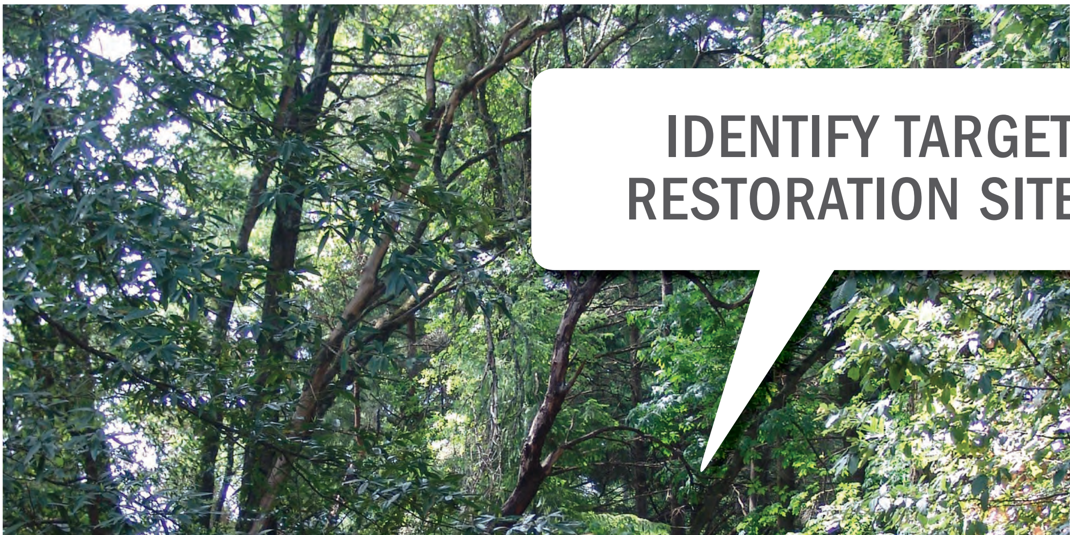
IDENTIFY TARGET RESTORATION SITES