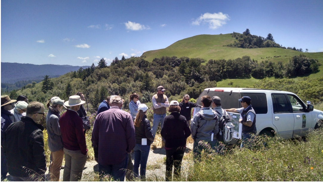
Spotlight Stewardship Tour at Mindego