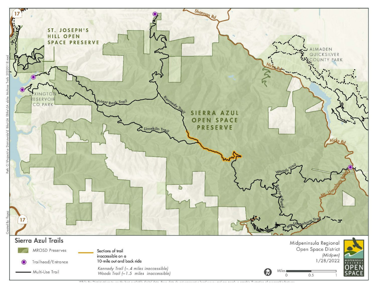
Figure 1. Segment of trail in Sierra Azul more than 5 miles from a trailhead.

Another area in which e-bikes appear to differ from traditional mountain bikes is the ability for e-bikes riders to ride longer without tiring and thus reach areas of preserves where wildlife is less habituated to existing mountain bike use, increasing impacts to wildlife. This particular concern is unlikely to be an issue within District lands given the size and trail networks within preserves. An analysis of District trails that are open to bicycles showed that Sierra Azul is the only preserve with bicycle trail segments more than 5 miles from a trailhead (i.e., not reachable on a 10-mile round trip). A 10-mile ride is a considered a moderate distance for traditional mountain bikes. The Kennedy Trail, Woods Trail, and Limekiln reach more than 5 miles into the heart of Sierra Azul (Figure 1), meaning there is a small area at the center that could not be accessed on a 10-mile round-trip ride. That area could be reached on a 15-mile round trip ride, which is still well within the norm for many mountain bikers on traditional bikes.