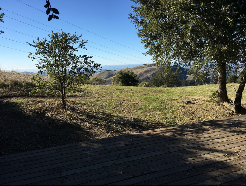
3 View from deck