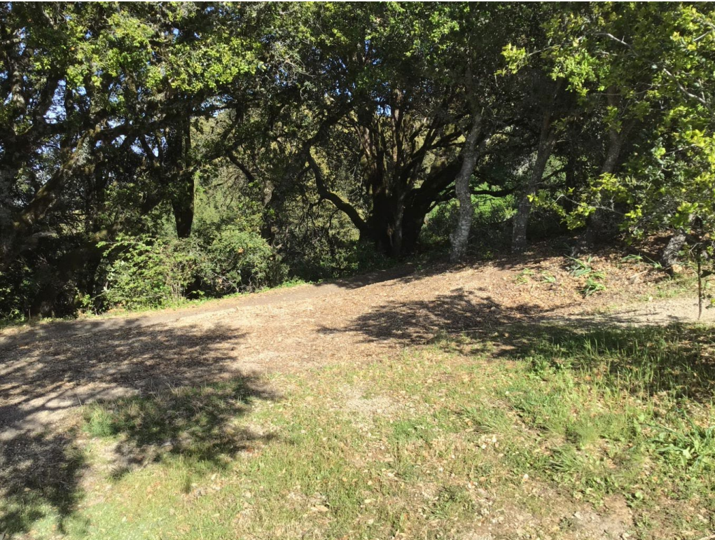
2--Same view after deck removed