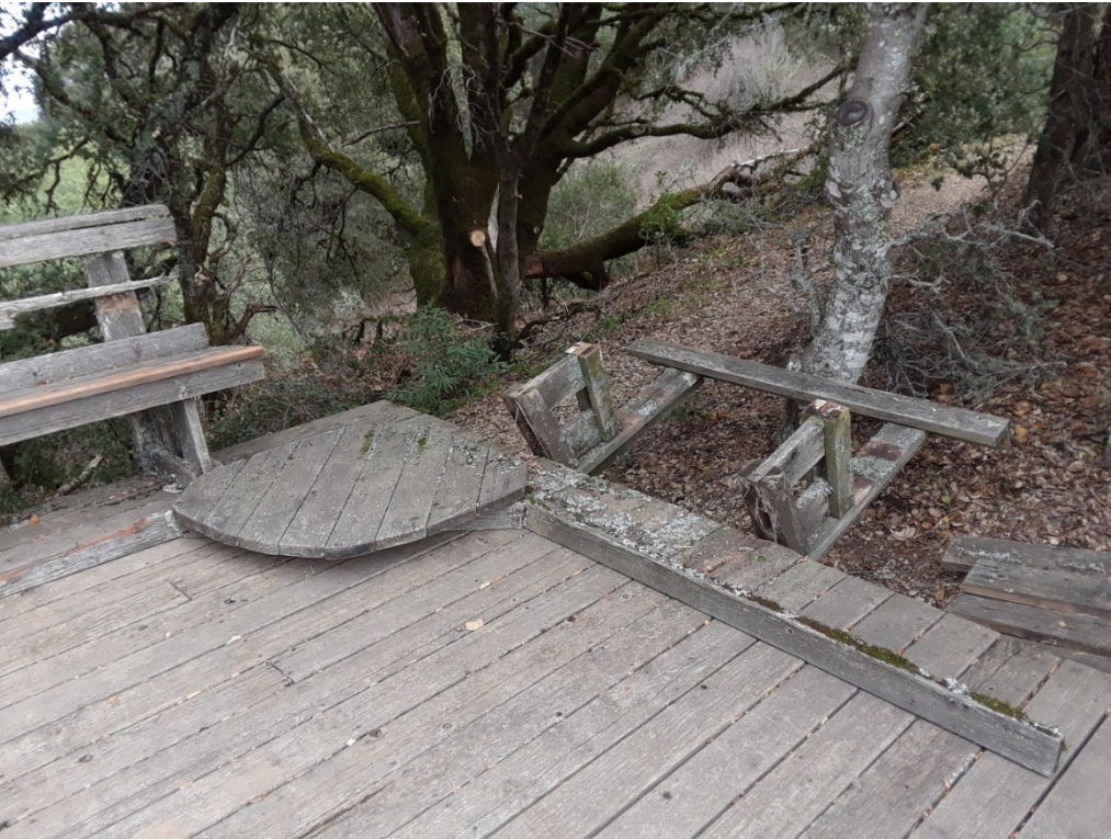
4 Vandalism to bench December 2021