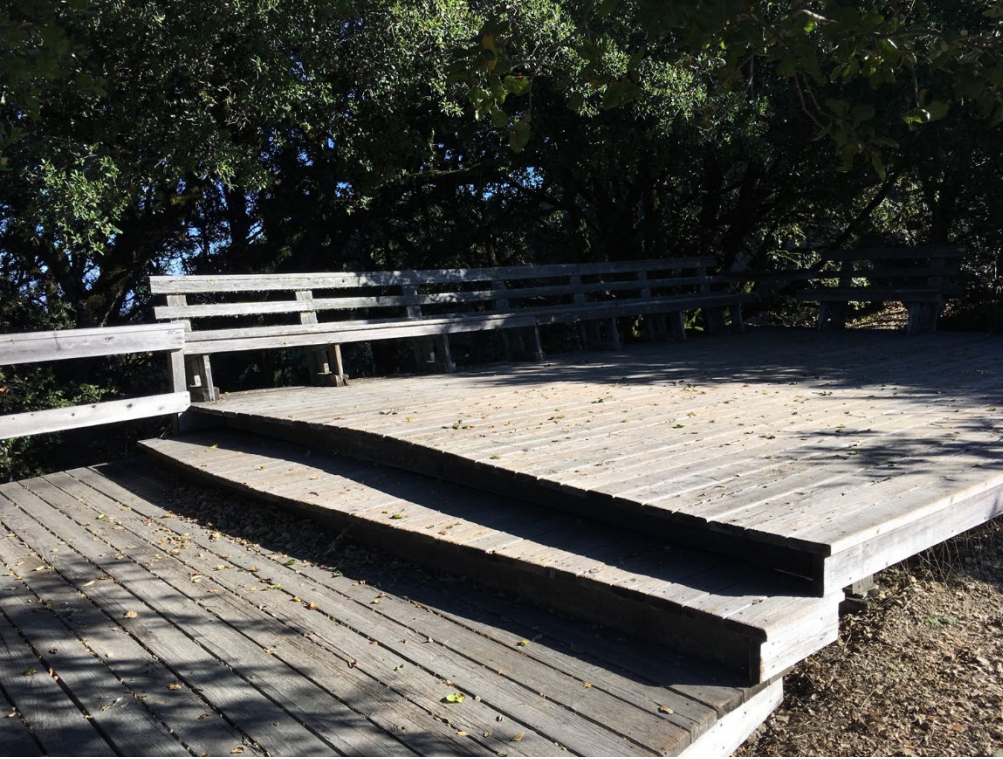
1 View of deck