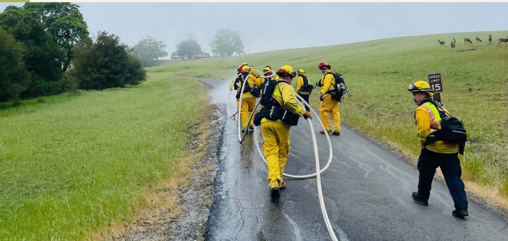
Top: Rancho San Antonio Open Space Preserve

Our Wildland Fire Resiliency Program contains four main elements to reduce wildland fire severity and risk within our region: vegetation management, preserve maps to assist responding fire agency personnel, landscape monitoring and prescribed fire. Midpen has developed and implemented priority projects focused on improving habitat resilience, which also serves to protect neighboring communities in the wildland urban interface. In FY23, the prescribed fire plan was finalized in partnership with Cal Fire. Midpen’s Board certified the Environmental Impact Report addendum and adopted the program in its entirety. Staff are now working on conducting prescribed burns to implement the program to promote healthy, resilient, fire-adapted ecosystems.