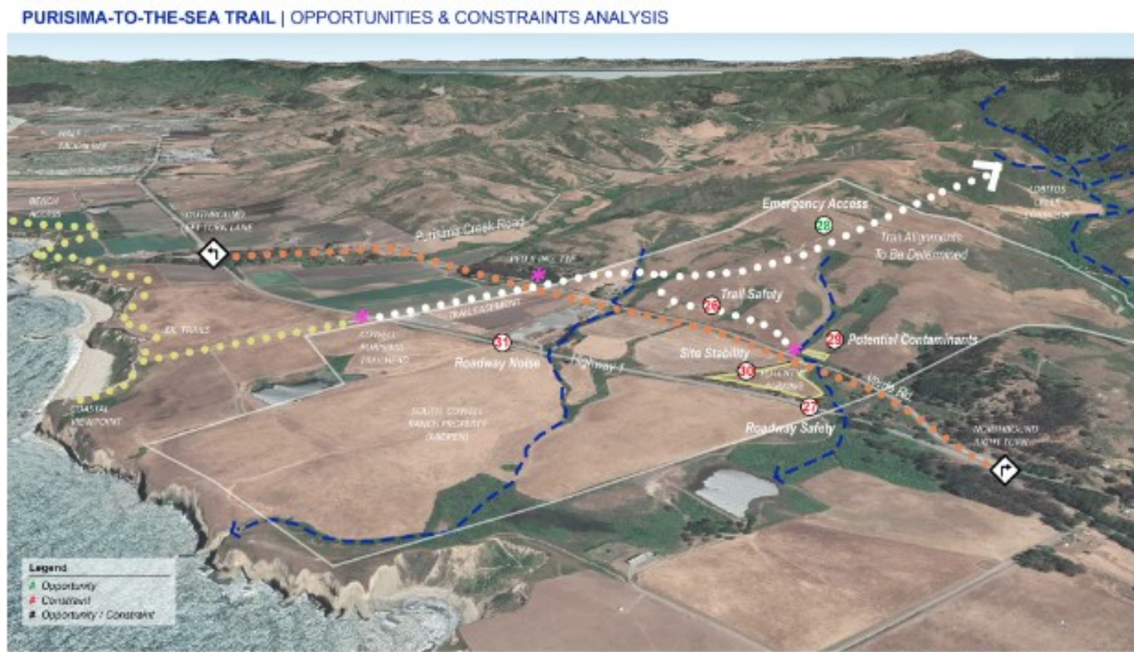
FIGURE 4 | SAFETY ATTRIBUTES