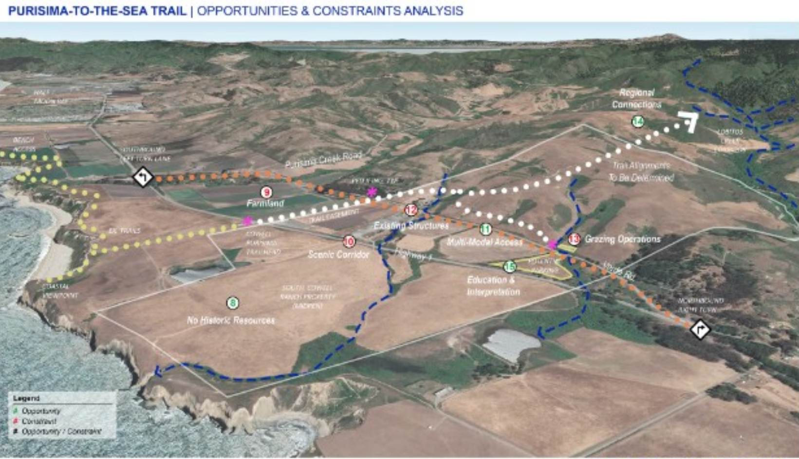
FIGURE 2 | CULTURAL ATTRIBUTES