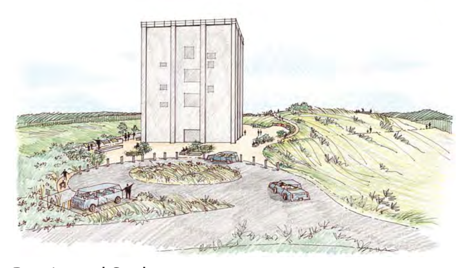
Retain and Seal