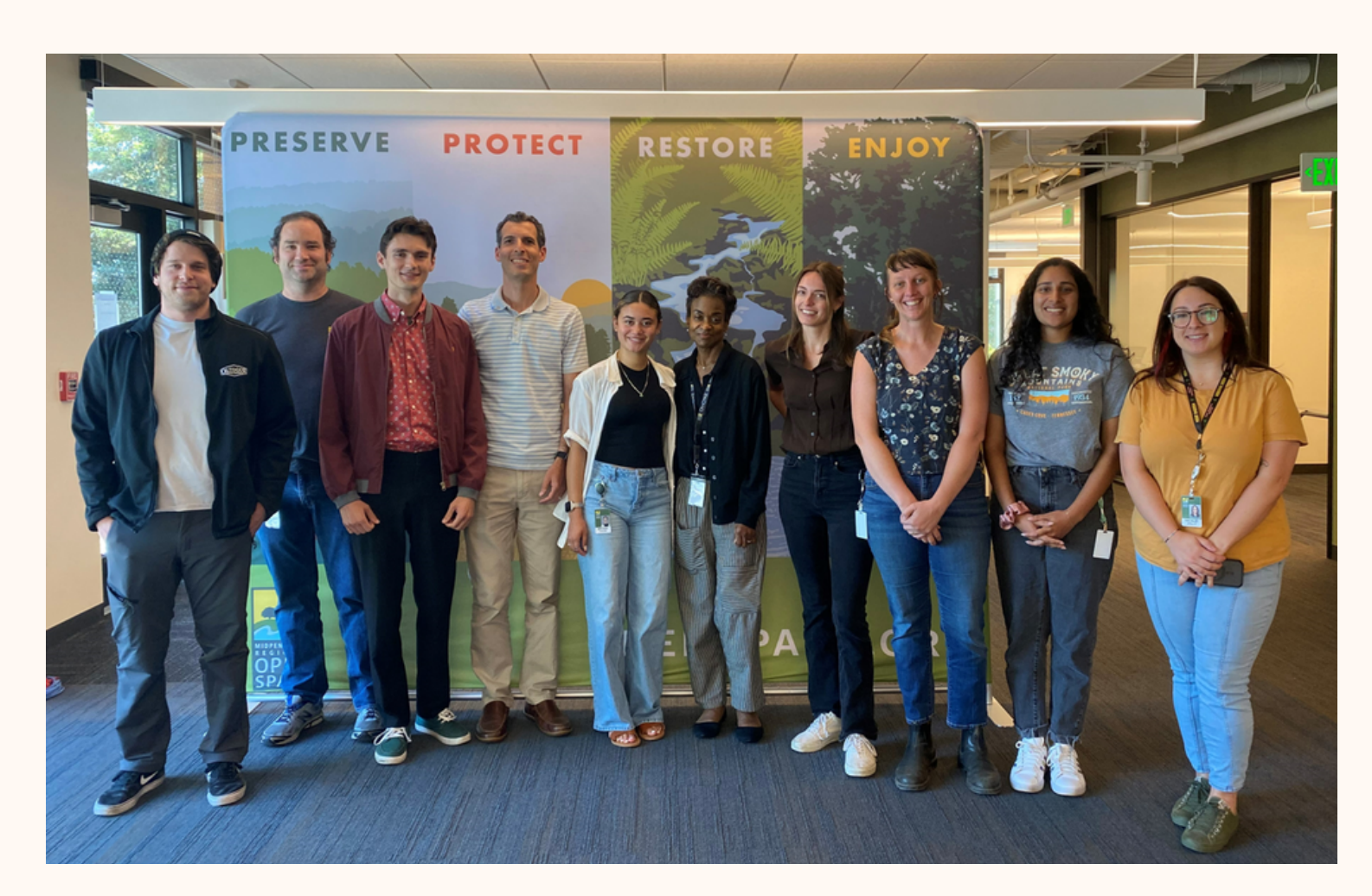
Interns and Supervisors at the 2023 Midpen Networking Event