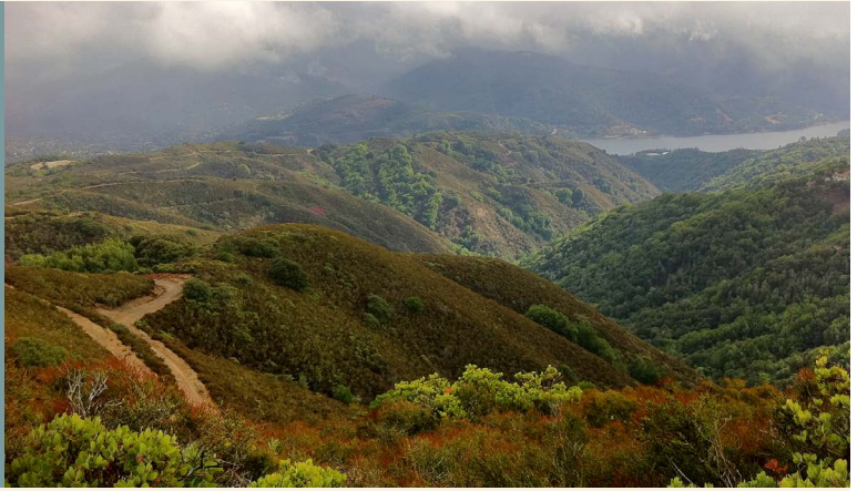
El Sereno Open Space Preserve (Midpen)