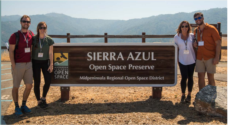
Sierra Azul Open Space Preserve