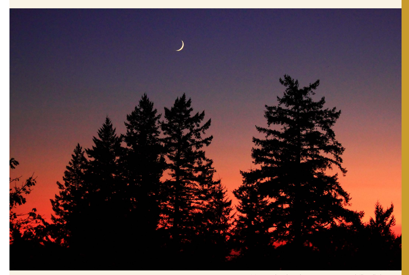
Purisima Creek Redwoods Open Space Preserve (Billy Feller)

Purchased a 45-acre riparian conservation and public access easement over private property along Lobitos Creek for protection of significant scenic, open space, riparian and natural wildlife habitat values. The easement also contains provisions for a possible future public trail through the area.