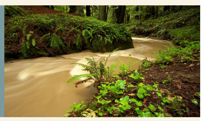
Purisima Creek Redwoods Open Space Preserve (Randy Weber)

Purisima Creek Redwoods Purisima-to-the-Sea Trail, Watershed Protection and Conservation Grazing