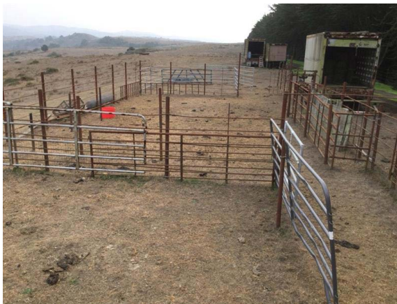
Cloverdale Ranch corral replacement: before (top), and after (below).

There are also some row crops within Midpen's coastal-area preserves, including seven acres of cut flowers in Purisima Creek Redwoods Preserve, 33 acres of produce in Miramontes Ridge Preserve and a historic chestnut orchard and Christmas tree farm in Skyline Ridge Preserve.