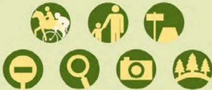
Goals Accomplished by This Action

Open Mt. Umunhum for multi-use public access to summit via road and trail. Open Bay Area Ridge Trail and nearby trail connections. Develop interpretive services and educational materials, especially for school groups. Determine and carry out plan for Radar Tower. Preserve additional open space and complete wildlife corridor as available.