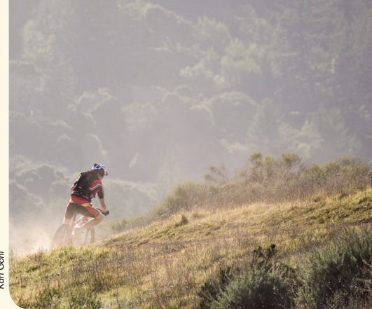
Monte Bello Open Space Preserve