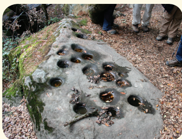
Skyline Ridge Open Space Preserve