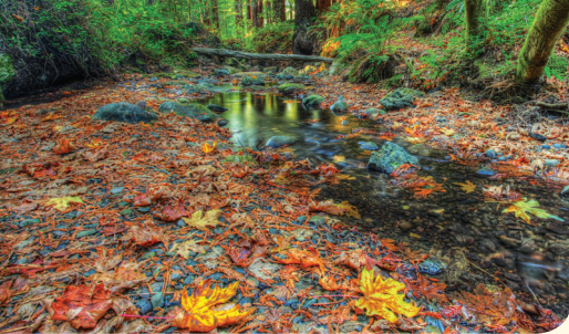
Purisima Creek Redwoods Open Space Preserve