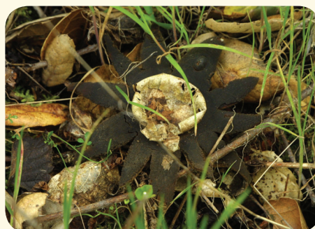
St. Joseph's Hill Open Space Preserve