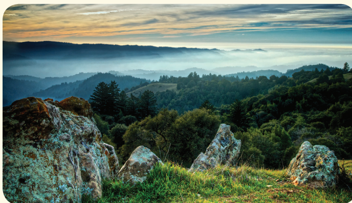
Long Ridge Open Space Preserve