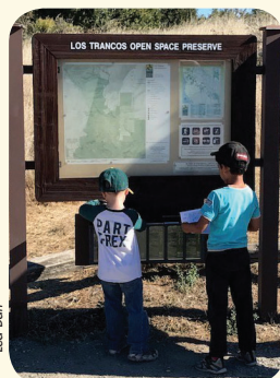
Los Trancos Open Space Preserve