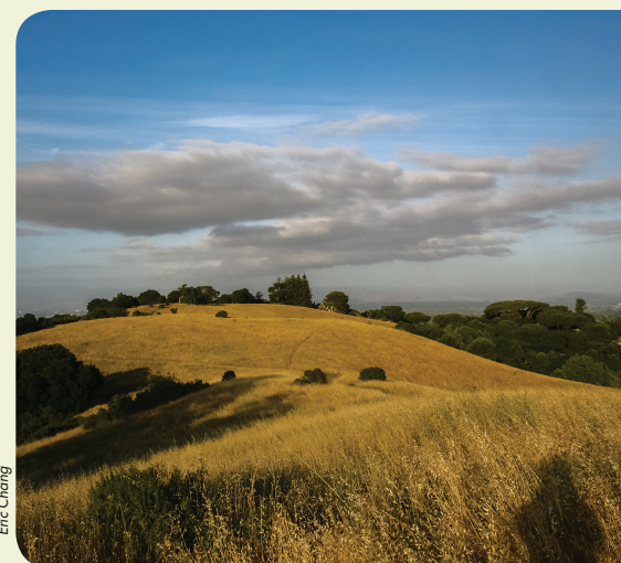
Fremont Older Open Space Preserve

Meet at the Caltrans vista point on the southeast corner of the Skyline Boulevard (Highway 35) and Highway 9 intersection.