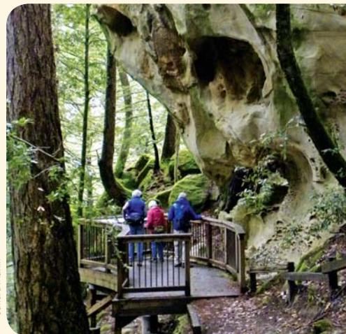
El Corte de Madera Creek Open Space Preserve

Late September is a good time to see birds not usually seen at other times of the year such as migrant duck, hawk, and songbird species. Docents Bill and Marilyn Bauriedel, and Farhana Kazi will identify and discuss various bird habits and habitats with you, as well as be on the lookout for fall nuts and berries. This leisurely-paced walk with an elevation gain of about 400 feet will take you to Horseshoe Lake and Alpine Pond, and through chaparral and oak woodland habitats.