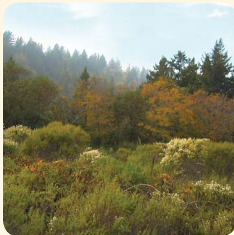
Bear Creek Redwoods Open Space Preserve

Please see the activity description for September 27. (Note: Scenic Aerobic Hike II is a strenuous hike with about 1,000 feet of gain.)