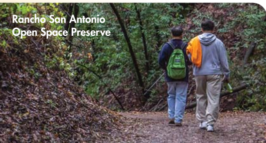
Rancho San Antonio Open Space Preserve

All activities are developed and led by docents who have completed a District training program. These docents volunteer their time to share their knowledge of nature with you. For more information about the volunteer docent program, visit the District's website at www.openspace.org , or phone the District at 650-691-1200 weekdays, 8:30 a.m.–5:00 p.m. 🦋