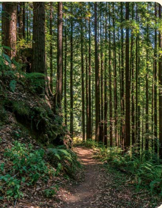
Purisima Creek Redwoods Open Space Preserve

Please see the activity description for September 2.