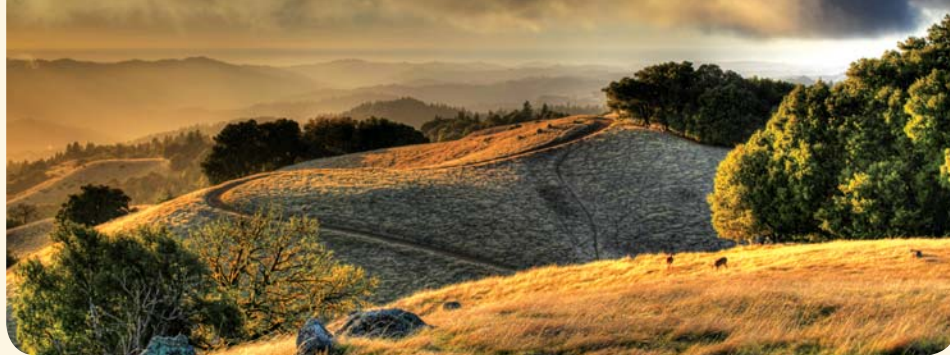
Long Ridge Open Space Preserve