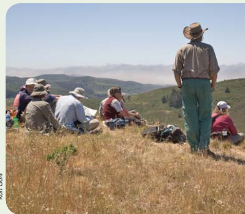
Miramontes Ridge Open Space Preserve

From I-280, exit Alpine Road in Portola Valley. Go south on Alpine Rd. about 2.9 miles to Portola Road (the first stop sign). Turn right on Portola Rd. and travel 0.8 miles to the parking lot on the left side of the road. 🌿