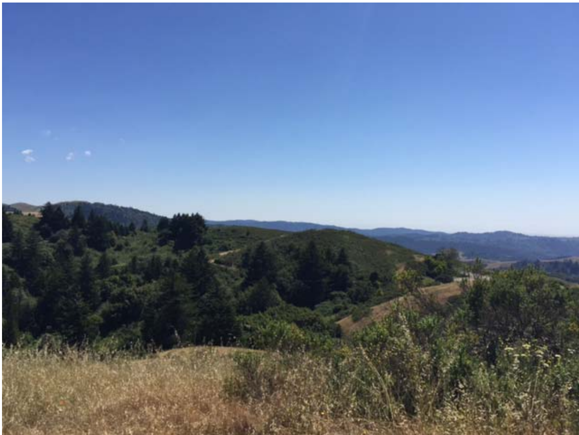
View from the proposed Herb Grench Overlook looking east