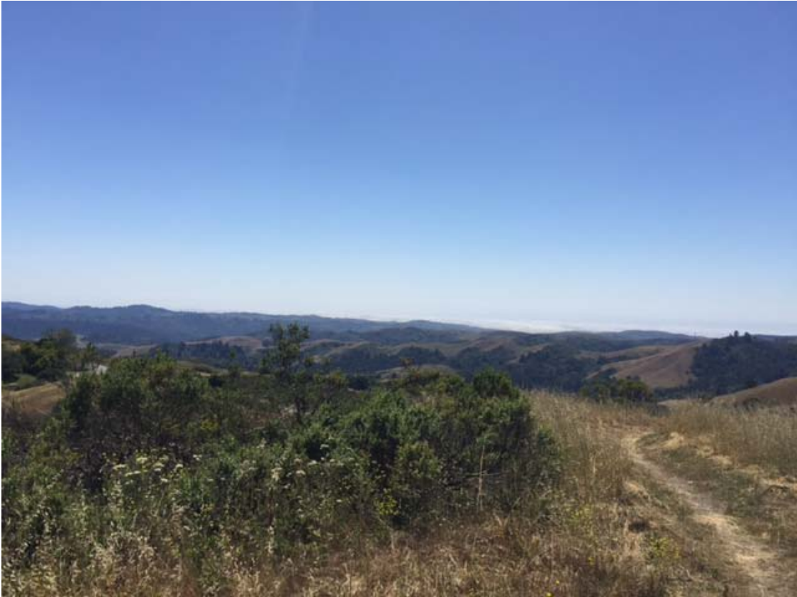
View from the proposed Herb Grench Overlook looking south