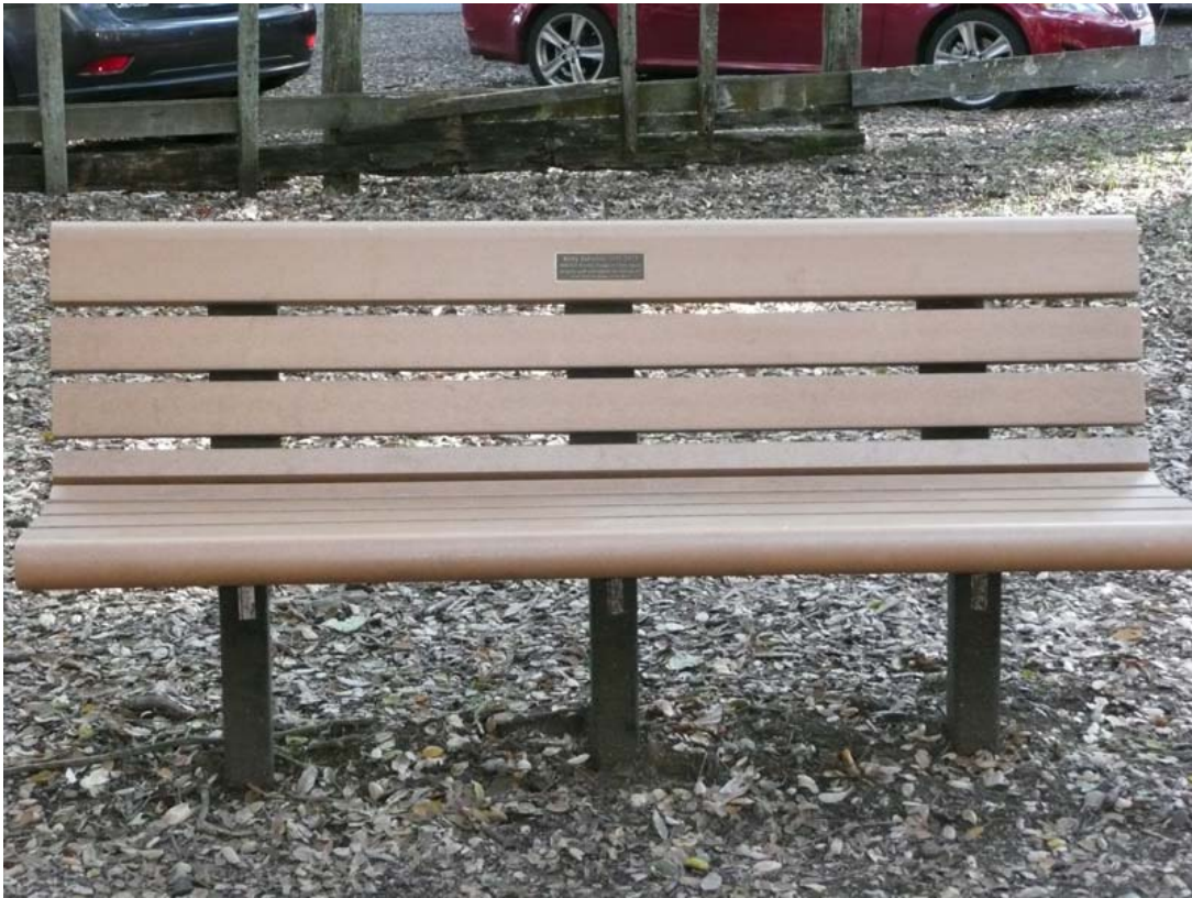
Standard District Bench – bench type for the proposed Herb Grench bench