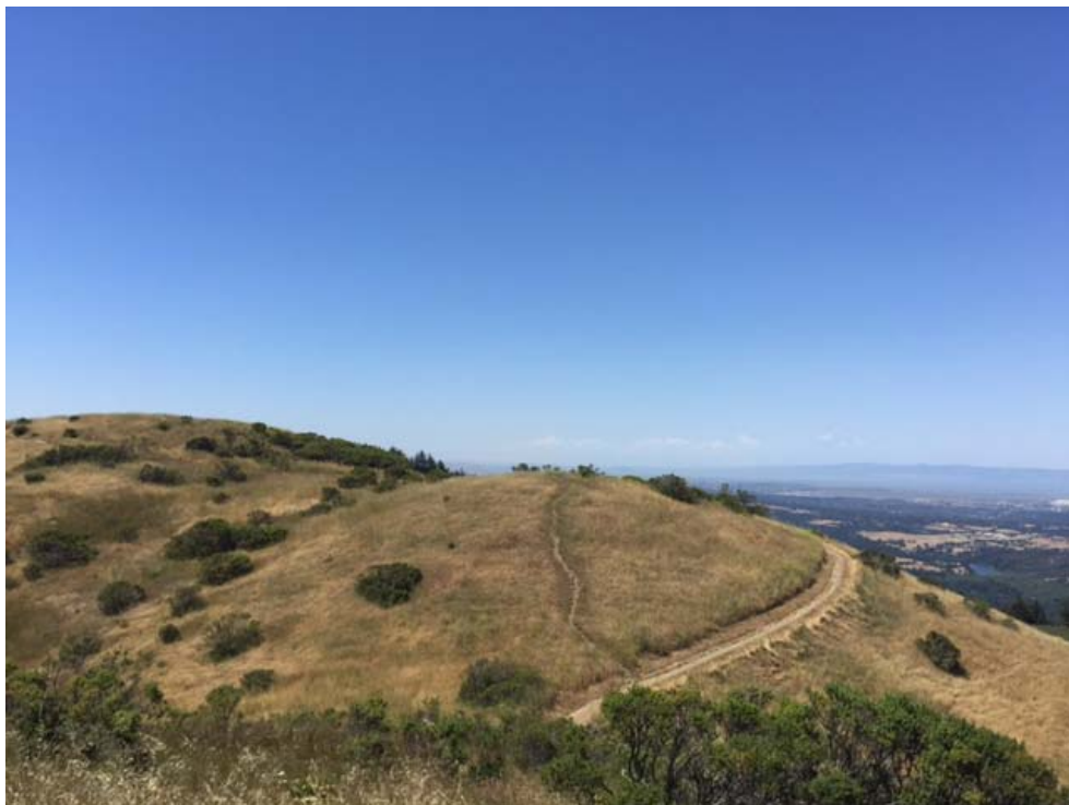
View from the proposed Herb Grench Overlook looking north (toward Palo Alto/Menlo Park)