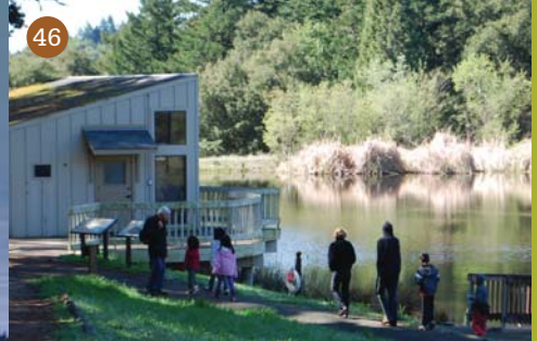
Enhance environmental education centers