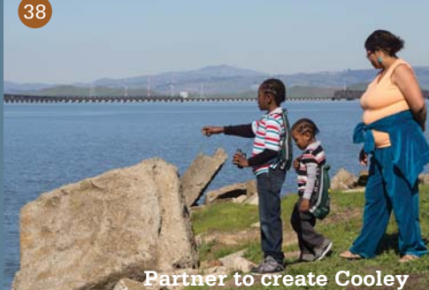
Landing education center